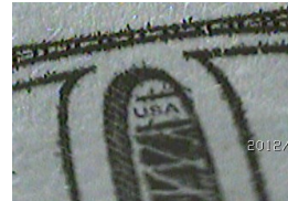
Macro-Zoom on $20.00 Bill