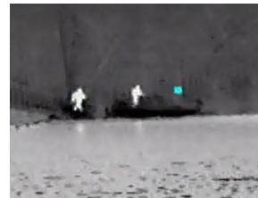
Suspects at 300'